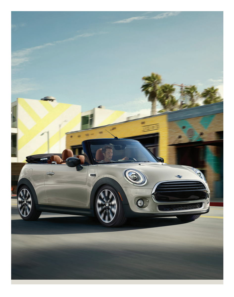
NEW PASSENGER CAR LIMITED WARRANTY 2021 MINI.